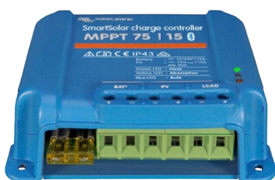
SmartSolar Charge Controller MPPT 75/15